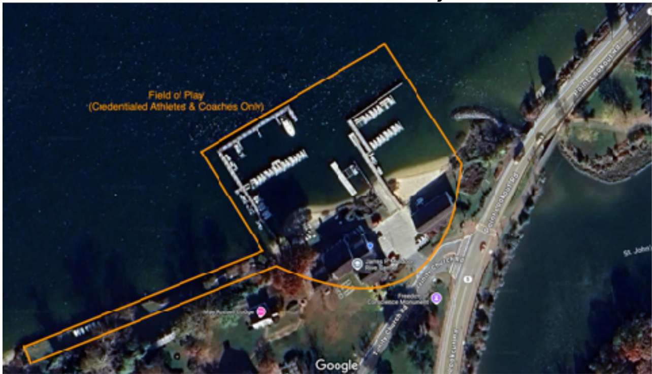
National Championship Practice Exclusion Zone Map

James P. Muldoon River Center at the Teddy Turner Waterfront