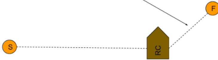
Diagram not to scale