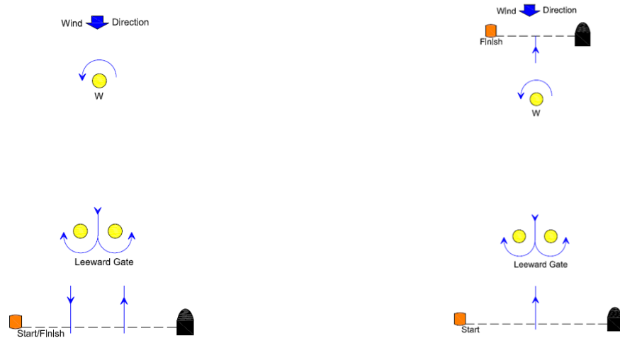
4 Leg Course Diagram

7.2 The number of legs to be sailed will be designated by a numeral pennant flown on the signal boat at or before the warning signal.