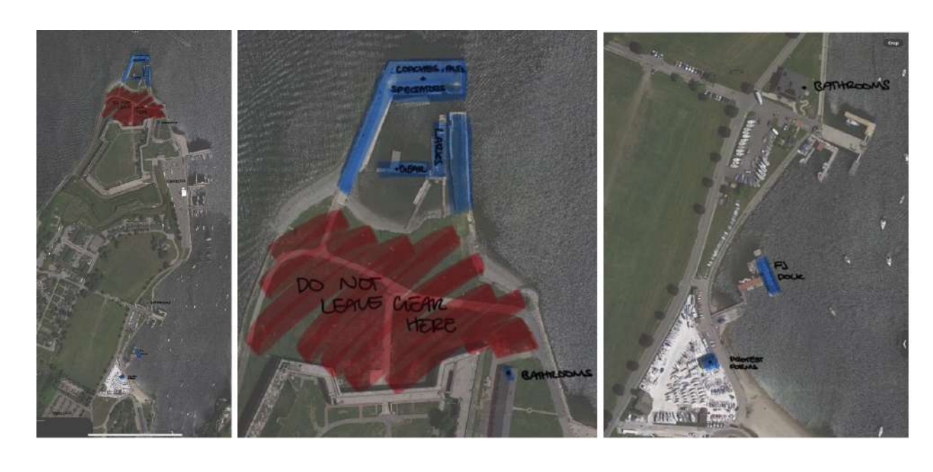
APPENDIX B Venue Map